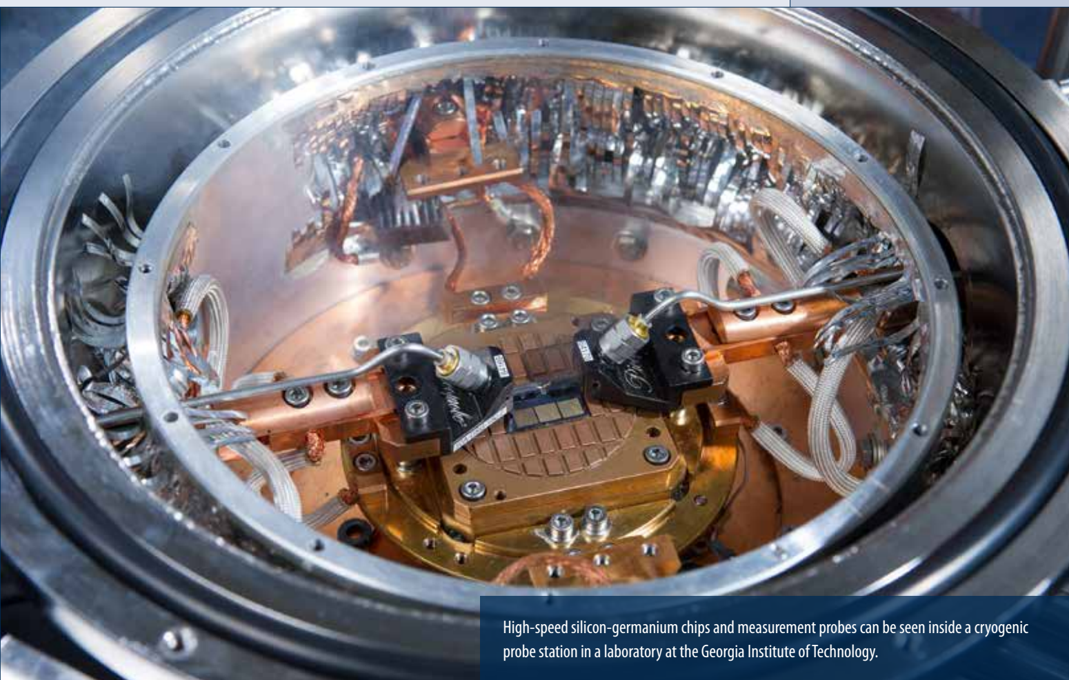
High-speed silicon-germanium chips and measurement probes can be seen inside a cryogenic probe station in a laboratory at the Georgia Institute of Technology.